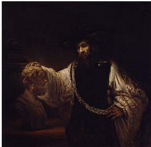
Aristotle and a Bust of Homer Rembrandt

The philosopher's life is therefore spacious. He is not hemmed in and constricted like others, because all ages are at his service." ~ Seneca (1 st c. Stoic Philosopher)