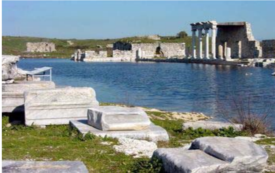
Miletus in Ionic Greece (now Turkey)