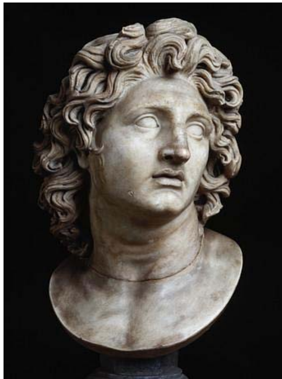
ALEXANDER the GREAT His Conquests Spread Hellenism